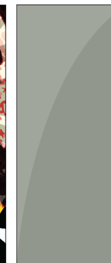
Smoky Green painting